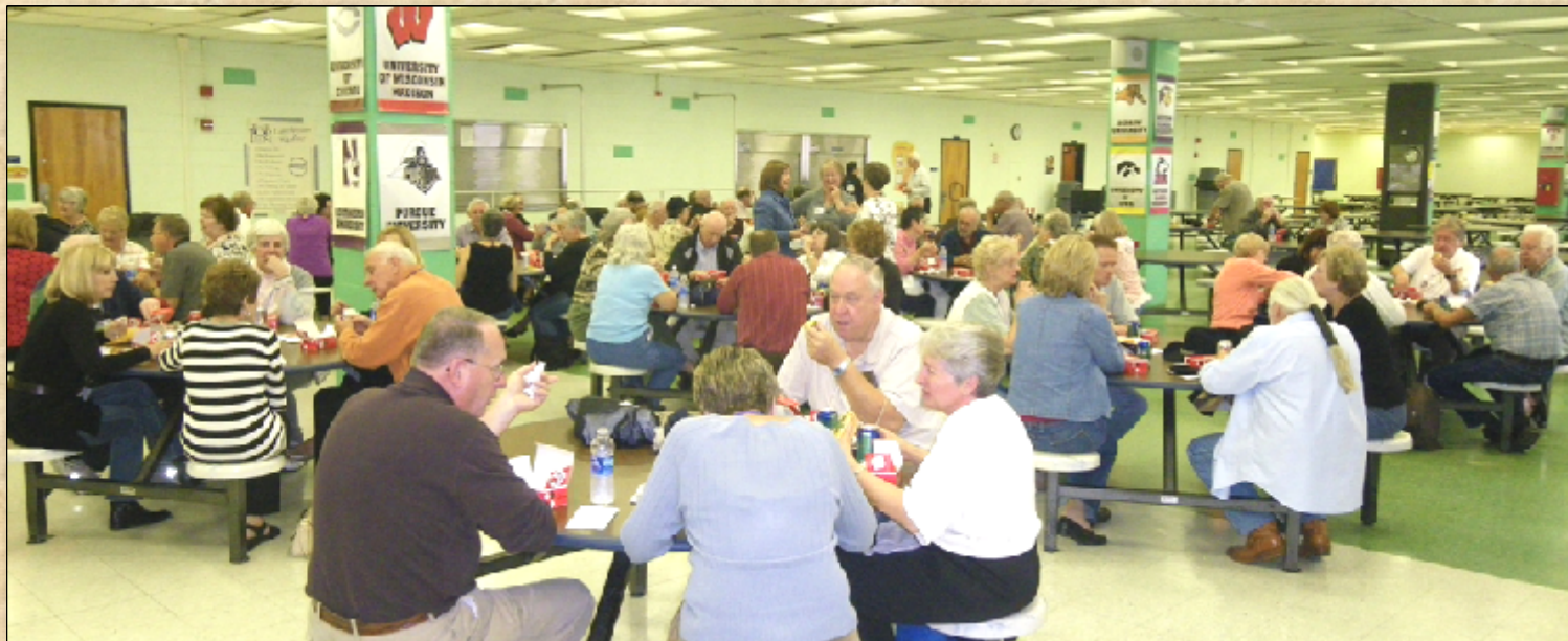
Superdawg lunch in the Taft cafeteria was a big hit! Some say it's was tipping-point reason they came to the reunion.