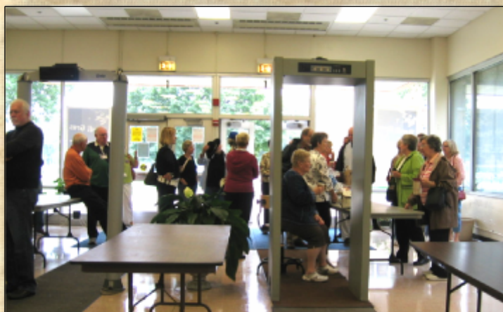
Given all the titanium hip & knee replacements in the group, the metal detector was turned off so the tour could take place before nightfall.