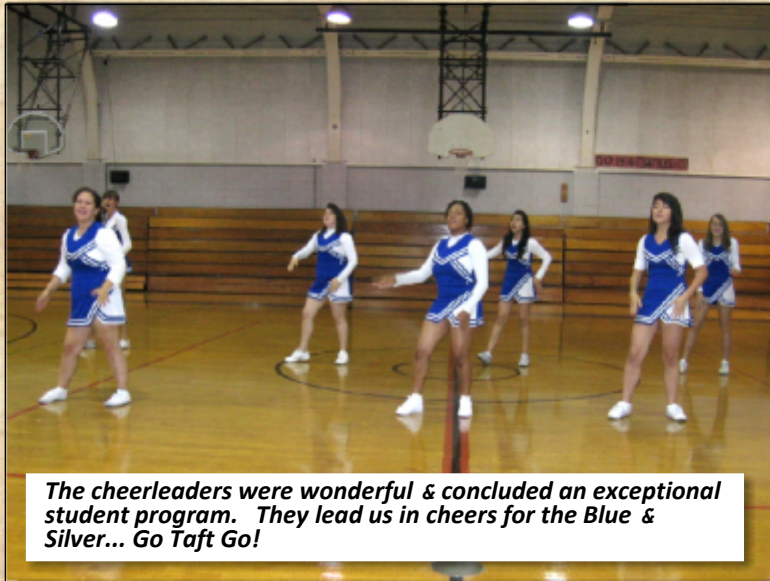
The cheerleaders were wonderful & concluded an exceptional student program. They lead us in cheers for the Blue & Silver... Go Taft Go!

All the Taft students voluntarily gave up their Saturday morning to make our celebration of the 50th Anniversary visit to Taft memorable... and they surely accomplished that goal!