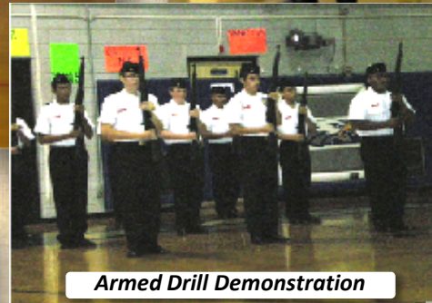
Armed Drill Demonstration

The Naval Junior Reserve Officer Training Corps , (NJROTC), Drill Demonstrations took place in the Joe Kupcinec Gymnasium, (Our school gym in the 50's)