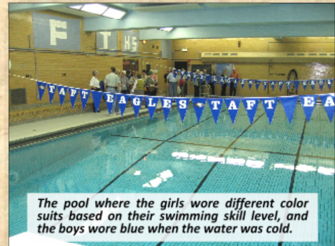
The pool where the girls wore different color suits based on their swimming skill level, and the boys wore blue when the water was cold.