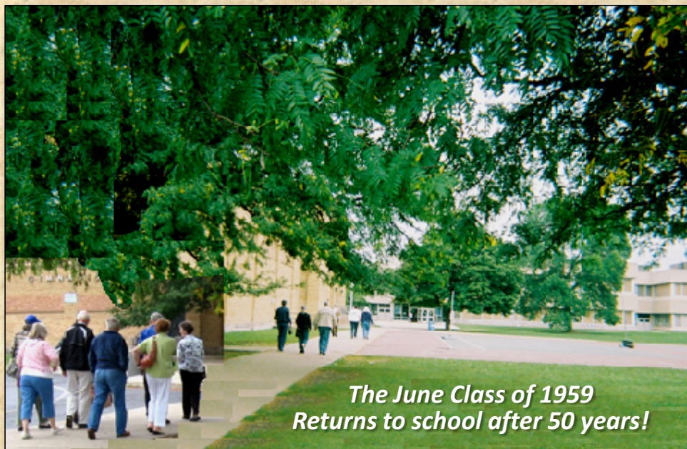
The June Class of 1959 Returns to school after 50 years!