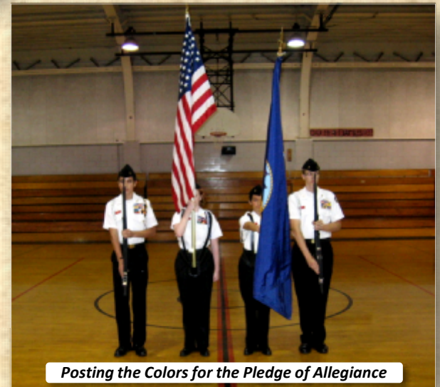
Posting the Colors for the Pledge of Allegiance