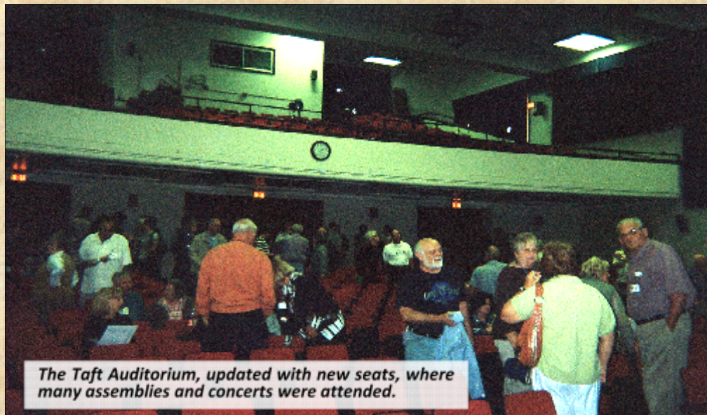
The Taft Auditorium, updated with new seats, where many assemblies and concerts were attended.