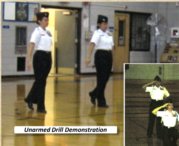
Unarmed Drill Demonstration

The Naval Junior Reserve Officer Training Corps , (NJROTC), Drill Demonstrations took place in the Joe Kupcinec Gymnasium, (Our school gym in the 50's)