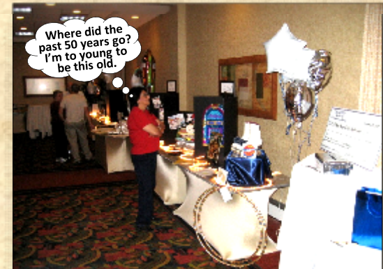
Don't cry because it is over, smile because it happened.