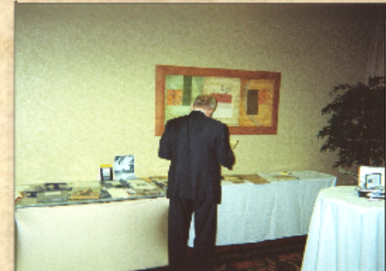
Strange unknown man crashing our reunion to get ideas on how to stage a reunion of a life time.