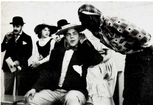
A race track scene by the Drama Club