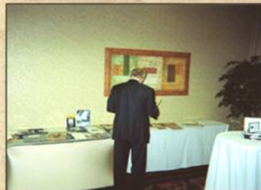
Strange unknown man crashing our reunion to get ideas on how to stage a reunion of a lifetime.