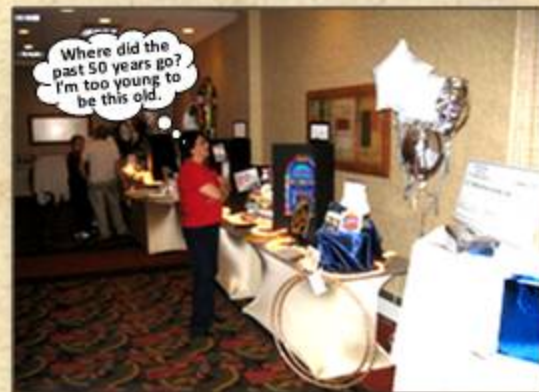
Don't cry because it is over, smile because it happened.