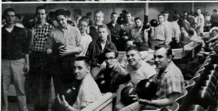
Above, top to bottom; Fire Balls, Sharp Strikes, Gutter Gals.