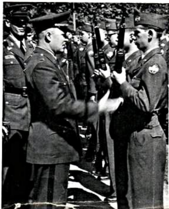
(right) Inspection of Rifle Platoon by inspecting officer accompanied by battle commander