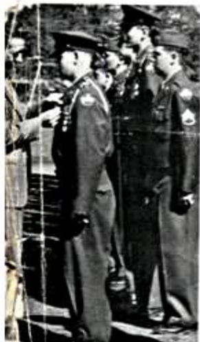
(left) Awards being presented to outstanding cadets