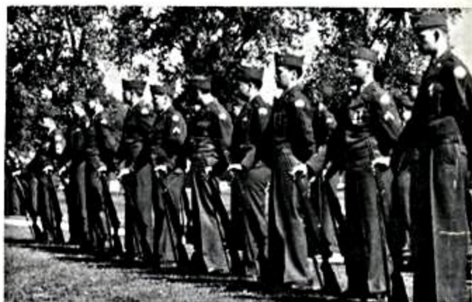
Waiting, waiting, waiting . . . .