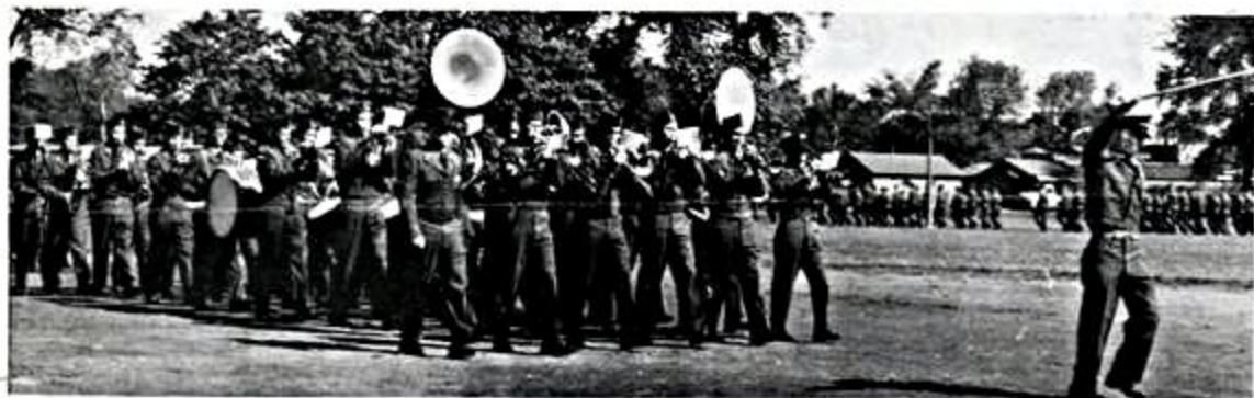
ROT C Band passes in review